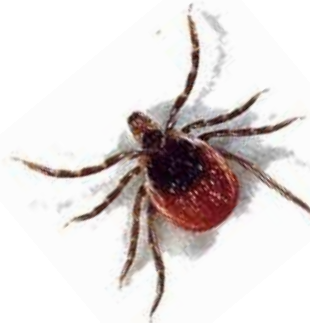
Ixodes scapularis (deer tick)

TICKS WILL ATTACH ANYWHERE UNDERARMS, WAISTBAND, HEAD, THIGHS, HAIRLINE, BEHIND THE KNEES AND KNAPE OF NECK